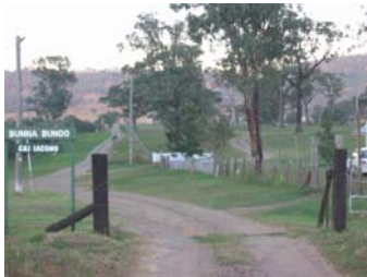
Entrance to private road leading to Illa Langi.