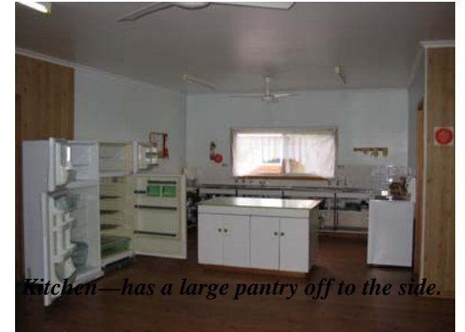
Kitchen—has a large pantry off to the side.