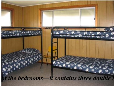
One of the bedrooms—it contains three double bunks.

NO PETS are allowed on property due to the fact that there are native animals on and around the surrounding properties.