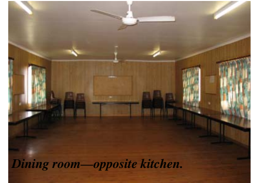
Dining room—opposite kitchen.