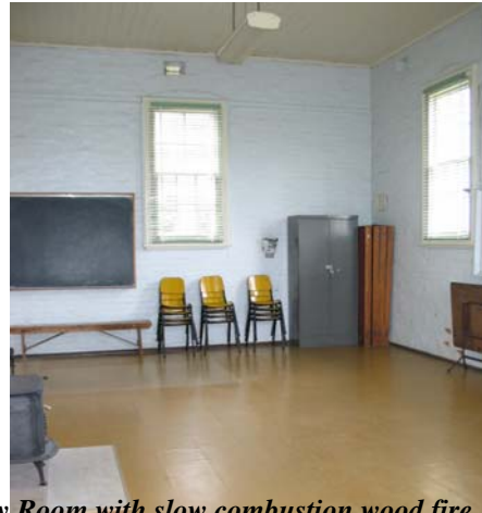
Activity Room with slow combustion wood fire.