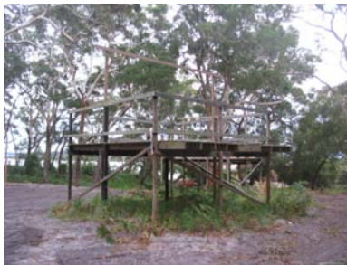
One of the platforms on which to erect your tent.

The Campsite has three (4 metre by 4 metre and 2 metre high) raised platforms on which to erect the dome tents. These platforms are unique and allow magnificent views of the area. Each platform accommodates a 6 person dome tent and all gear comfortably. The platforms are accessed by wooden ladders.