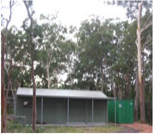
The shed contains kitchen, shower & toilet facilities.

Taylor's Beach Campsite is able to accommodate 25 persons. It has an onsite shed which houses a kitchen, shower, 2 x toilet facilities and storage area. There are six dome tents available for hire.