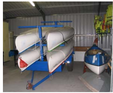
Canoes and PFD's available for hire.

Please Note: Canoes can only be taken out with a boating qualified person. Refer to Boating Guidelines.